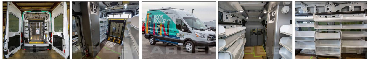
Sample photos from Pittsburg Public Library Bookmobile

We waited an extra year to get an EV versus gas powered van.